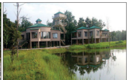
Barnawapara Wildlife Sanctuary