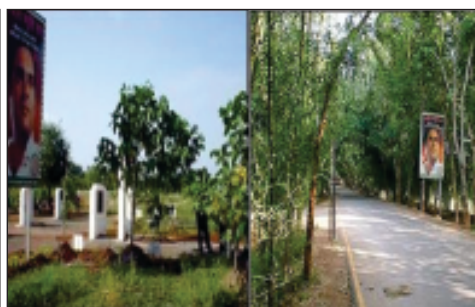
Rajiv Smriti Van