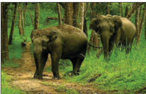
Kanha National Park