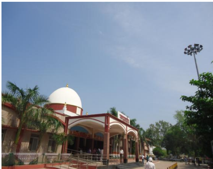
Manduadih Railway Station