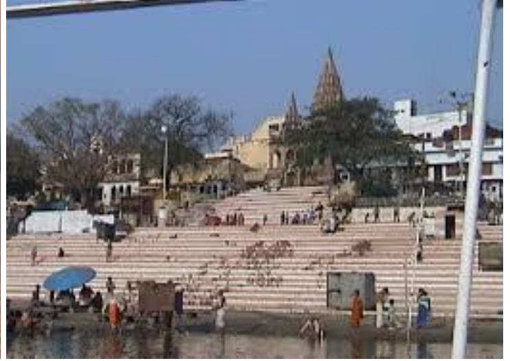
Assi ghat Varanasi