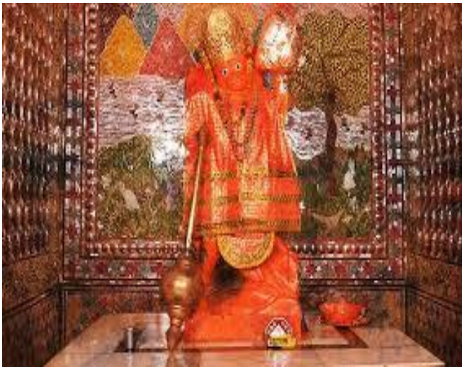
Sankat Mochan Temple, Varanasi