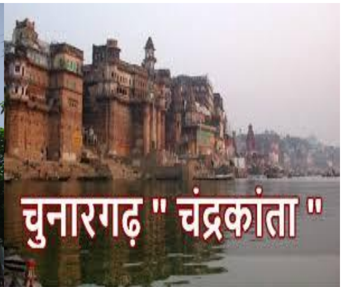
चुनारगढ़ " चंद्रकांता "