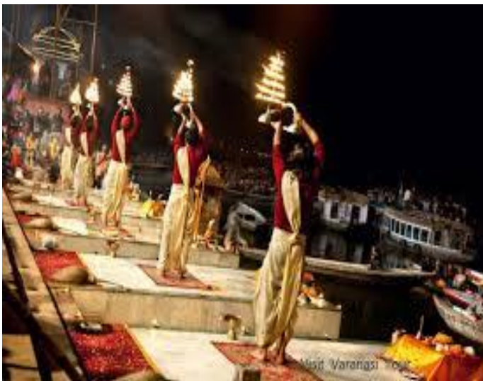
Dashashwamedh Ghat - Ganga Arti