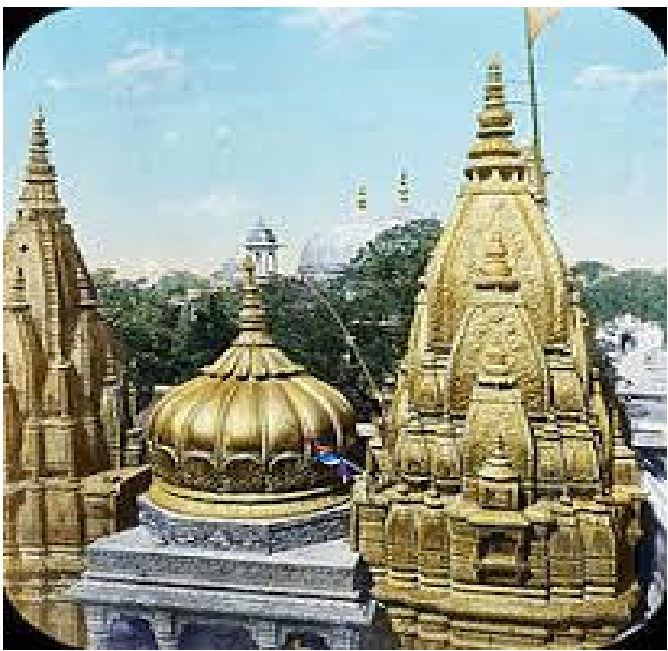
Kashi Vishwanath Temple