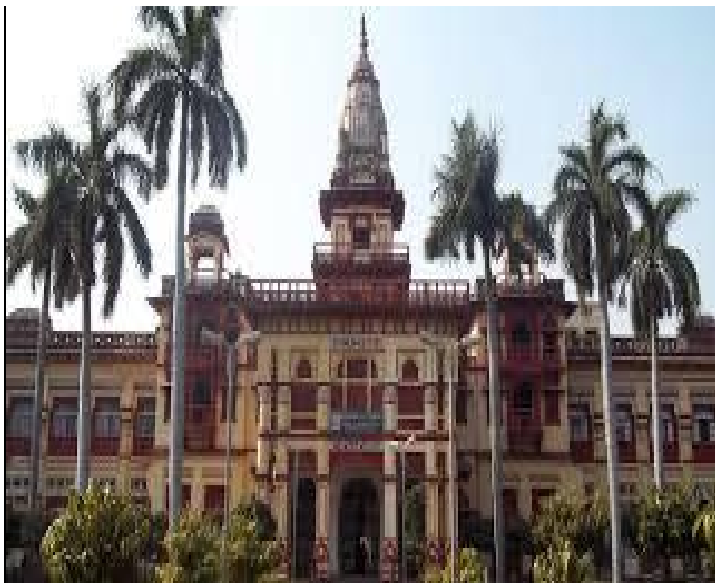
Sampranad Sanskrit University