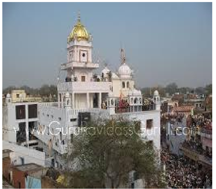
Guru Ravidas temple, Varanasi