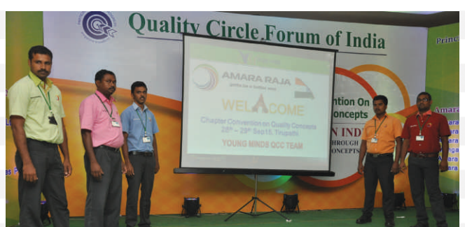
Case Study Presentation