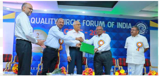
Inaugural Function 2nd CCQC 2016