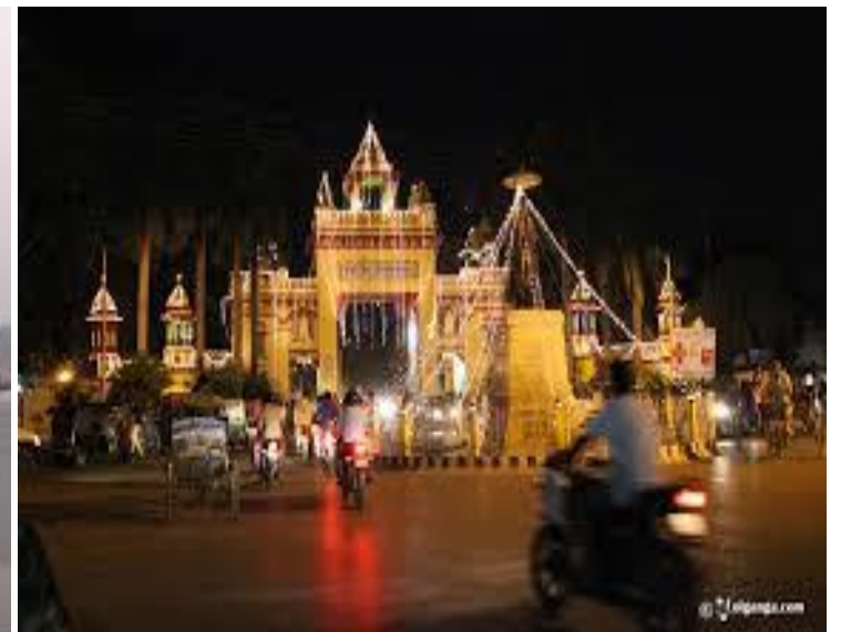
Banaras Hindu University