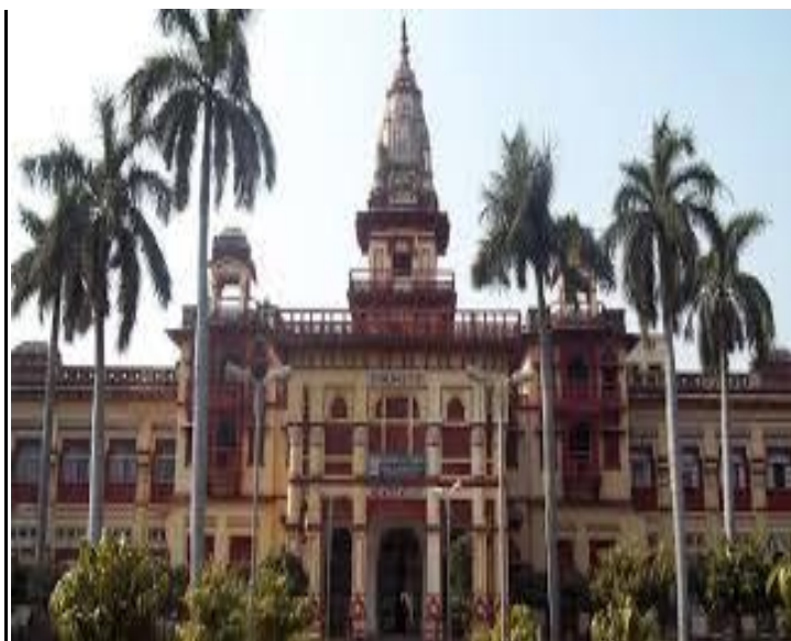
Sampranad Sanskrit University