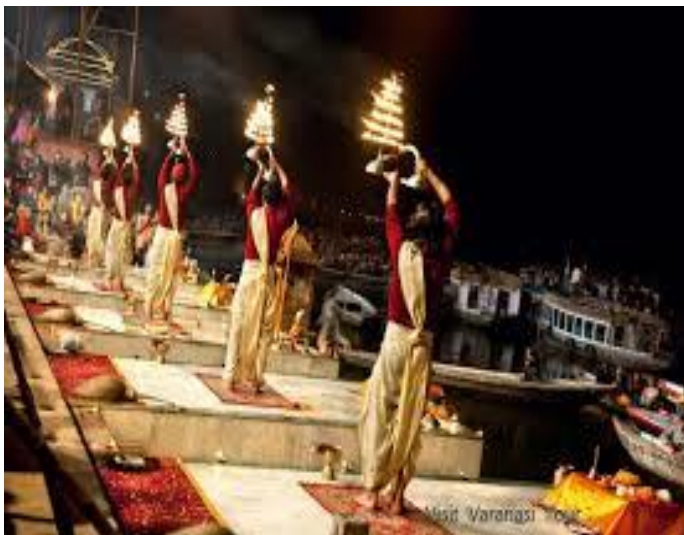
Dashashwamedh Ghat - Ganga Arti