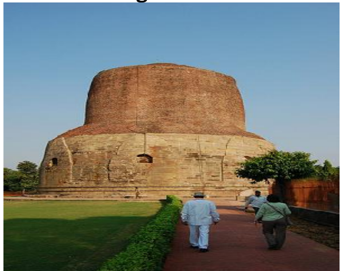
Sarnath- Where Buddha Gave His First Sermons