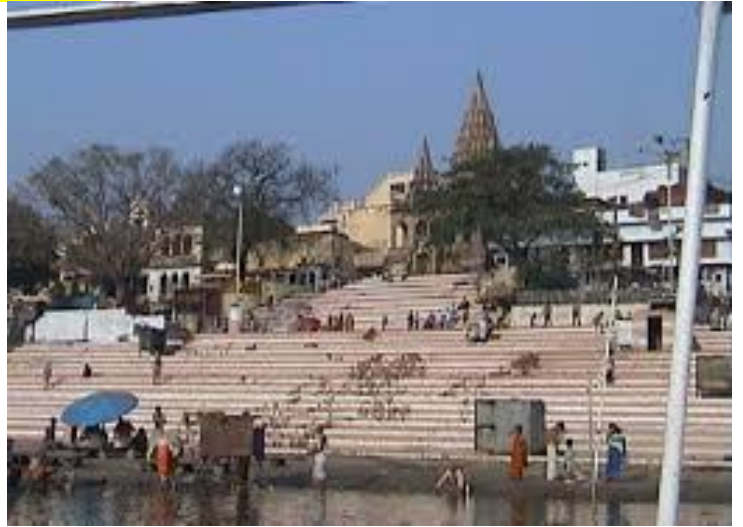
Assi ghat Varanasi