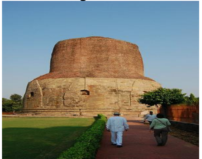
Sarnath- Where Buddha Gave His First Sermons