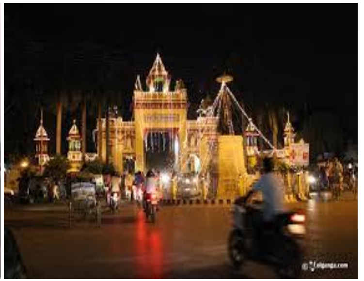
Banaras Hindu University