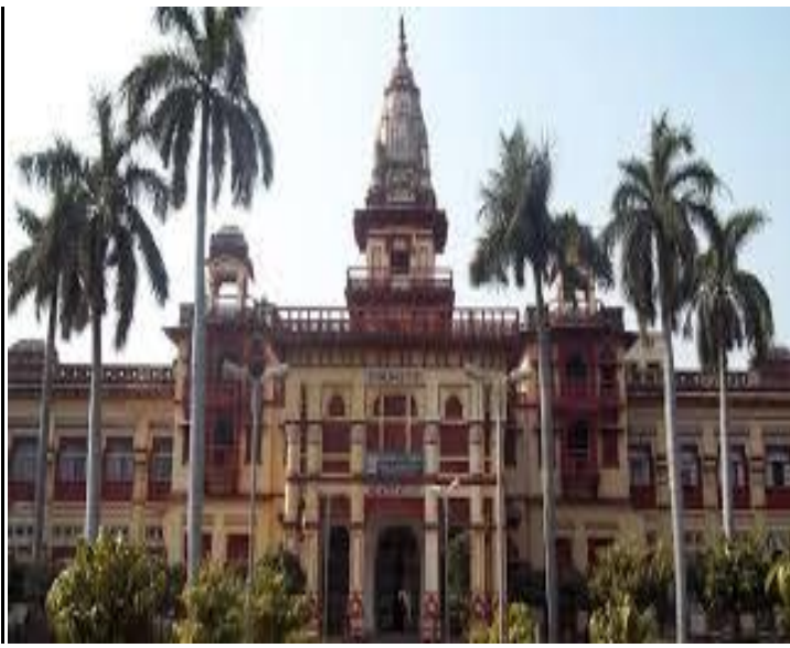
Samprnanad Sanskrit University