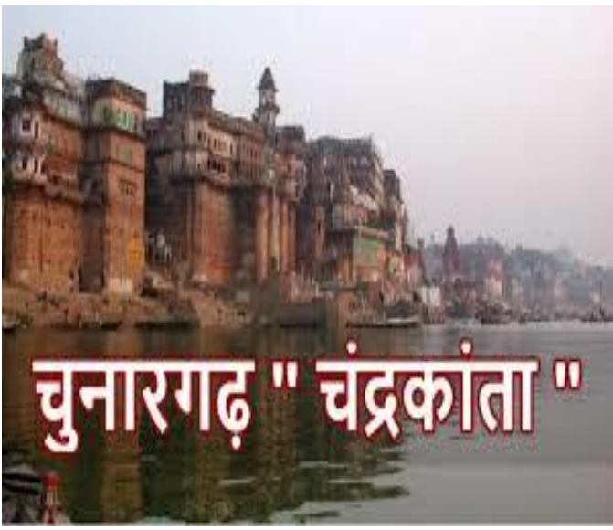
Manduadih Railway Station