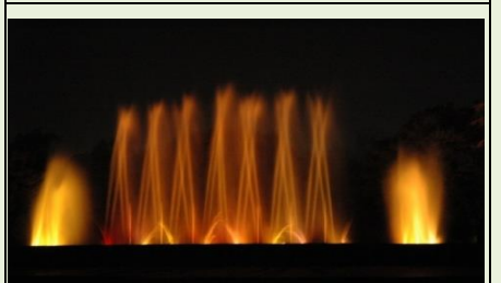
Musical Fountain at Maitri- Bag