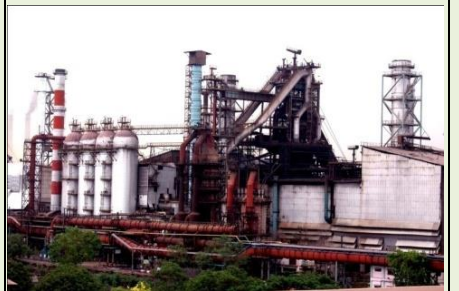
(Bhilai Steel Plant)