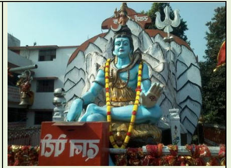
(Banjari Mata Mandir)

A mini-India in itself, Bhilai has over the years become the Centre of art and culture in the region. Bhilai is also widely acknowledged as the education and sports hub of the state. It has played a pivotal role in preserving the Chhattisgarhi folk arts. Bhilai is a city of Garden. A striking feature which immediately attracts any visitor to our Township and Plant is the large number of well-maintained gardens which provide our surroundings with a splendid splash of vibrant colours and dash of sweet fragrances. The Maitri Bagh Zoo, the biggest zoo in the region is located in Bhilai. The country's biggest musical fountain adds to the beauty of Maitri Bagh that already boasts of well-laid lush lawns. Boating facilities in artificial lake, toy train and Pragati Minar offering a panoramic view of the steel plant and surroundings. Having major attractions like : Tiger, Lion (Hybrid), Leopard , Spotted deer, Sambhar, Rose pelicans, Parakeet and Lion tailed monkey