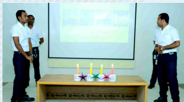
Case Study Presentation