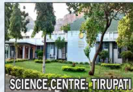
SCIENCE CENTRE: TIRUPATI