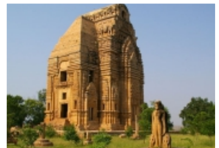
Teli K Mandir