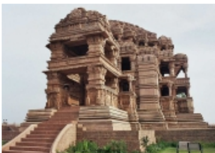
Saas Bahu Temple