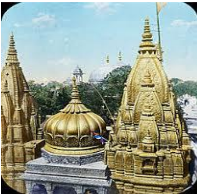
Kashi Vishwanath Temple