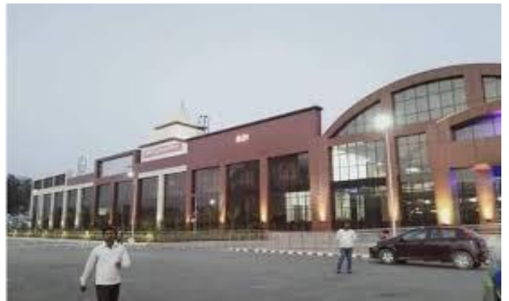
Manduadih Railway Station