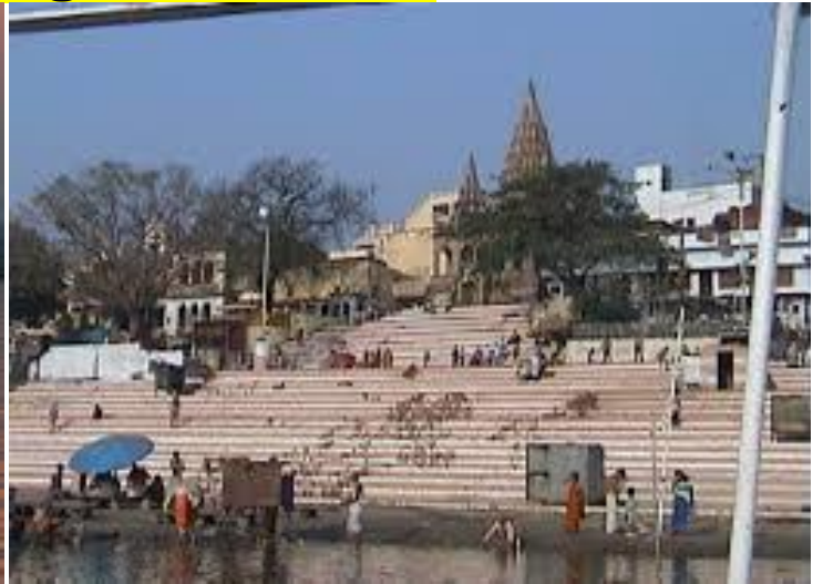
Assi ghat Varanasi