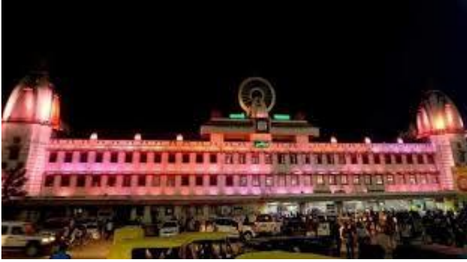
Varanasi Cantt Railway Station