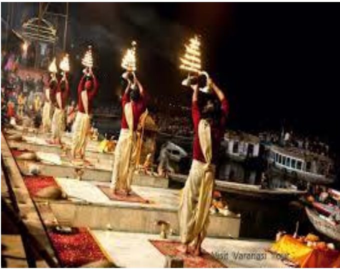
Dashashwamedh Ghat - Ganga Arti