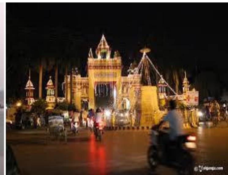
Banaras Hindu University (BHU)