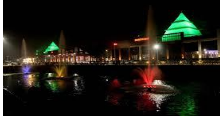
Manduadih Railway Station