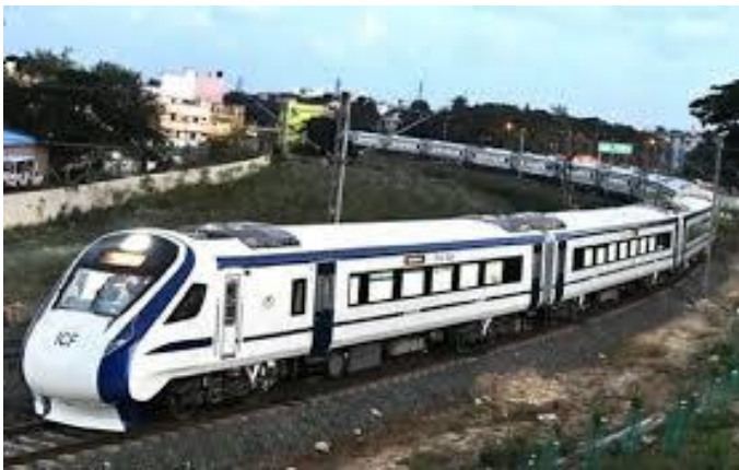
Vande Bharat Express