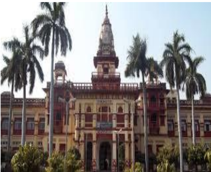
Sampranad Sanskrit University