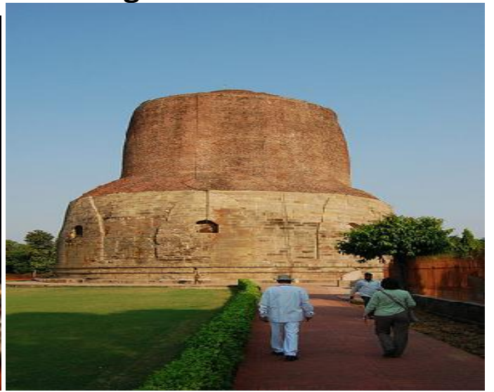
Sarnath- Where Buddha Gave His First Sermons