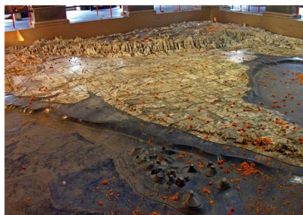
Bharat Mata Temple

Selected entries will be awarded a certificate. However memento will be given only to selected participant who have registered for NCQC 2019. The award function is slated on 28th December 2019 at 4.30 pm.