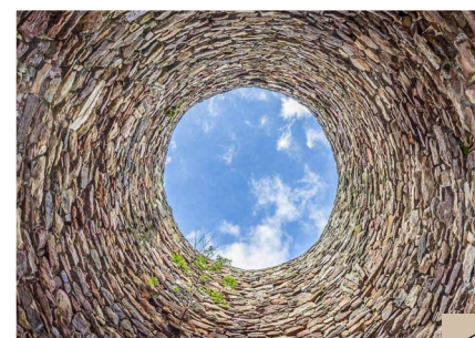
Gyan Vapi Well