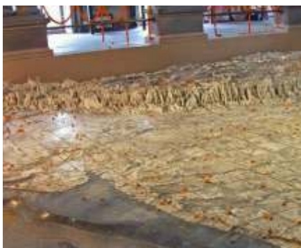
Bharat Mata Temple

Selected entries will be awarded a certificate. However memento will be given only to selected participant who have registered for NCQC 2019. The award function is slated on 28th December 2019 at 15.00 Hrs.