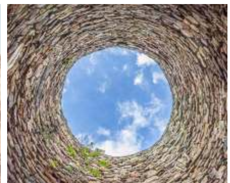
Gyan Vapi Well