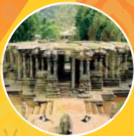
1000 pillar temple