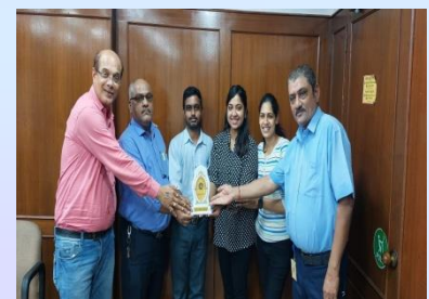
Godrej Industries Ltd., Valia Team won the Gold Trophy