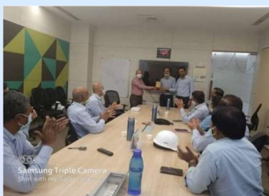
Deepak Phenolics Ltd., Dahej Team won the Gold Trophy