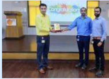
UPL Ltd., Ankleshwar Team won the Gold Trophy