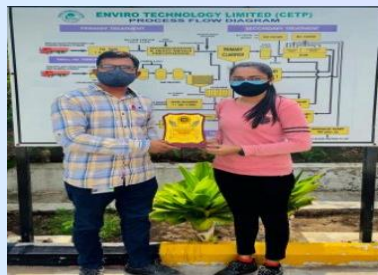
Enviro Technology Ltd., Ankleshwar Team won the Gold Trophy