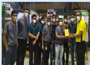
Kohler India Corporation Pvt. Ltd., Jhagadia Team won the Gold Trophy