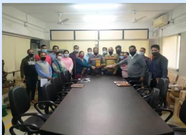
Shivalik Solid Waste Management Ltd. Team won the Gold Trophy