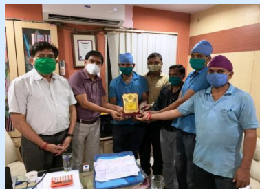
GRP Ltd., Ankleshwar Team won the Gold Trophy