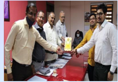
R.N.G. Patel Institute of Technology, Isroli, Bardoli Team won the Gold Trophy