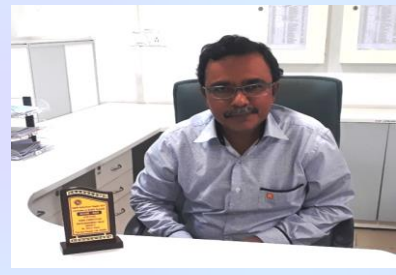
Torrent Power Ltd., DGEN Team won the Gold Trophy