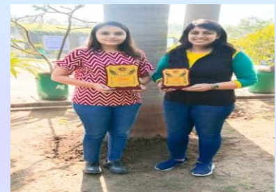
BEIL Infrastructure Ltd., Ankleshwar Team won the Gold Trophy