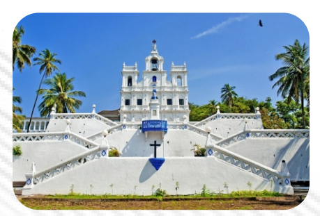
Immaculate Conception Church