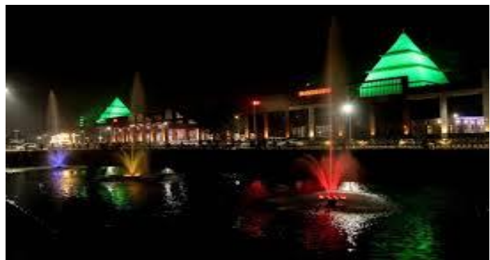
Banaras Railway Station