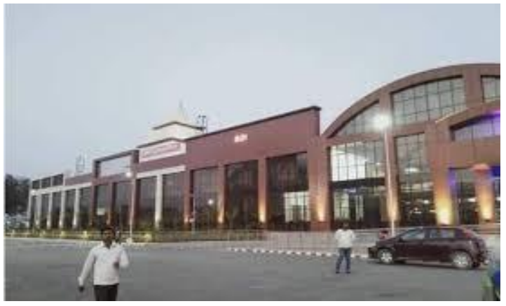
Banaras Railway Station