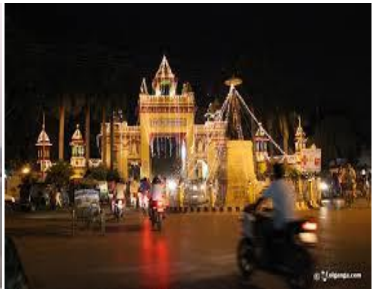
Banaras Hindu University (BHU)