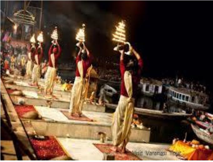
Dashashwamedh Ghat - Ganga Arti