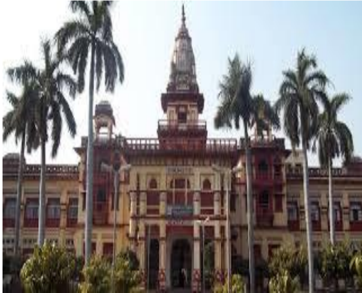
Sampranad Sanskrit University