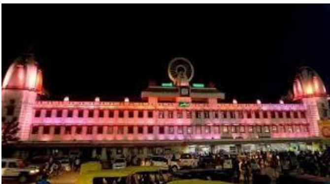
Varanasi Cantt Railway Station