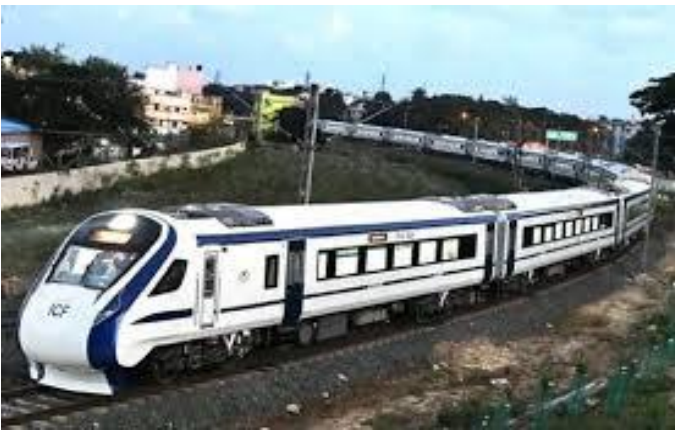
Vande Bharat Express