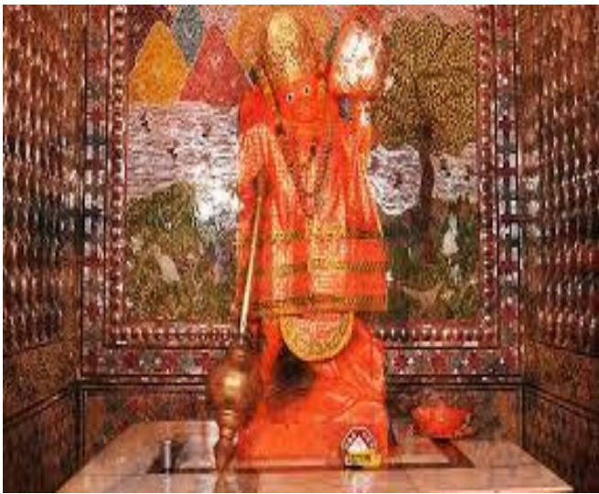
Kashi Vishwanath Temple