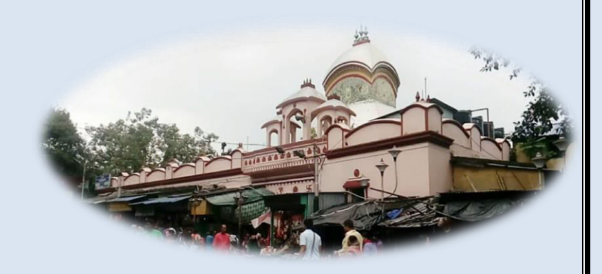
KALIGHAT KALI TEMPLE