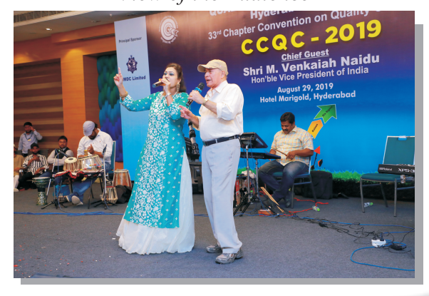
Entertainment through Musical Soiree...