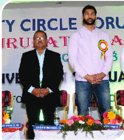
Inaugural Function of 4 th CCQC 2018