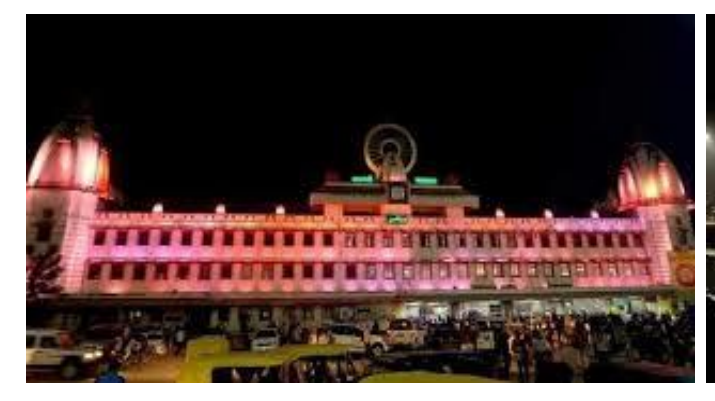
Banaras Hindu University (BHU)