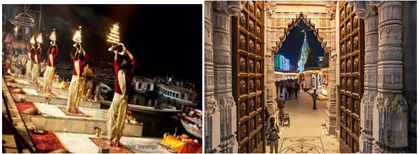
Dashashwamedh Ghat - Ganga Arti