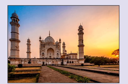
Bibi ka Magbara