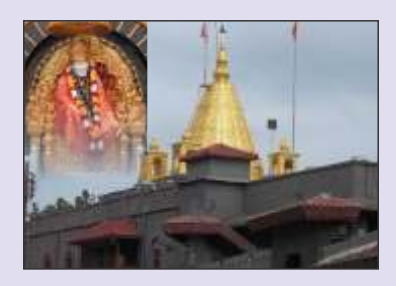
Shirdi Sai Baba Temple