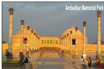
Ambedkar Memorial Park