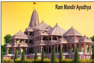
Ram Mandir Ayodhya