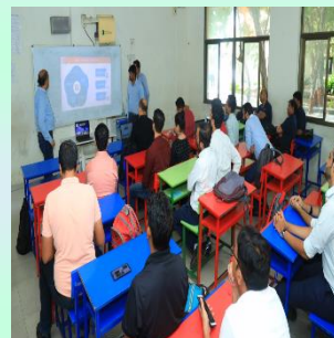
Team presenting Case study