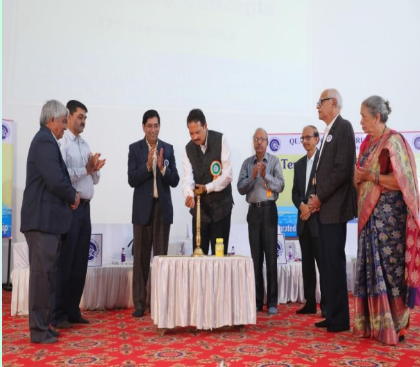
Dignitaries lighting the lamp