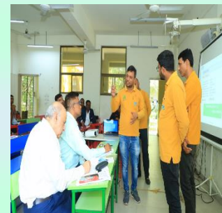
Question-Answer session by Judges