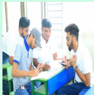
Participants giving knowledge test