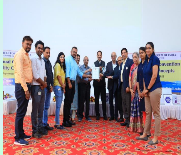
Team, M/s. BEIL Infrastructure Ltd., Ankleshwar receiving the QCFI JUSE Certificate