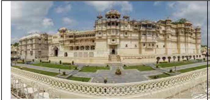
City Palace - Udaipur