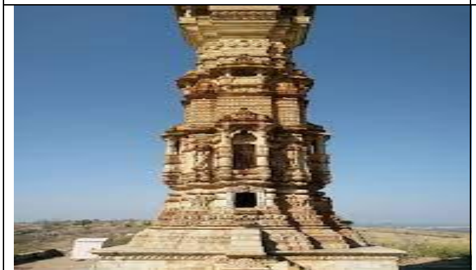
Vijay Stambh- Chittorgarh