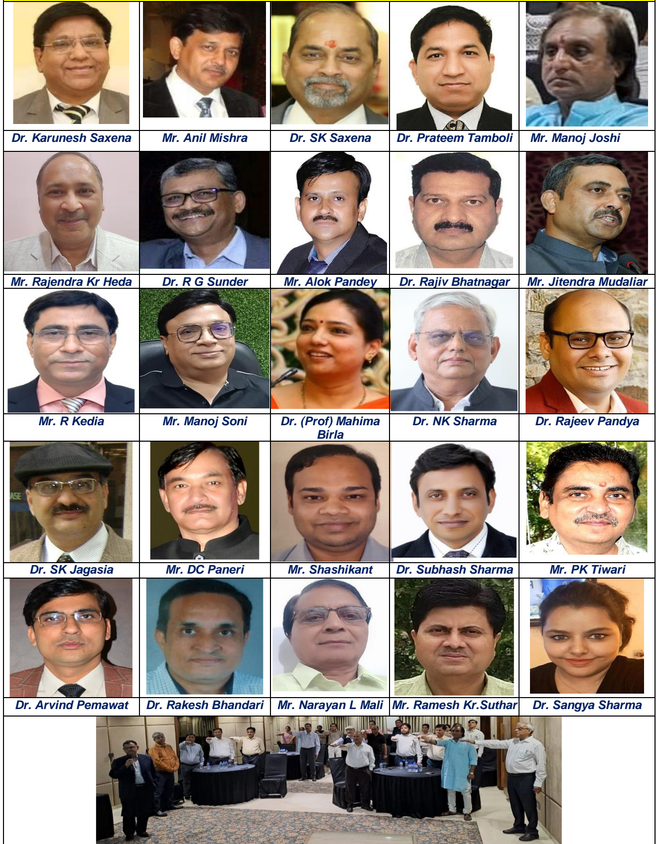
New Advisory Board & Council Members (2022-25)