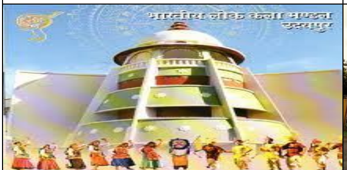
Lok Kala Mandal Udaipur