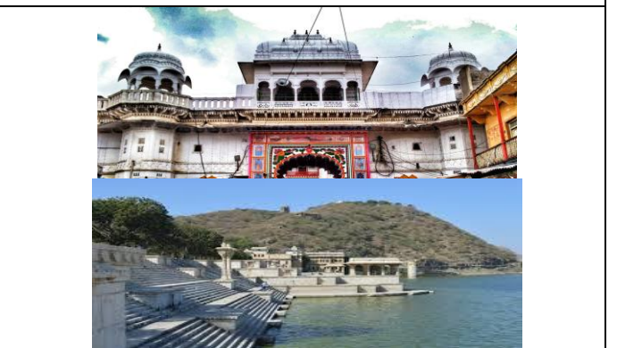
Dwarkadheesh Temple & Lake Rajsamand