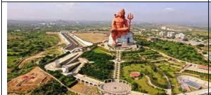
Biggest Shiv Murti- Nathdwara