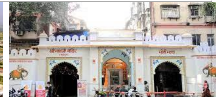
Srinath ji Temple- Nathdwara