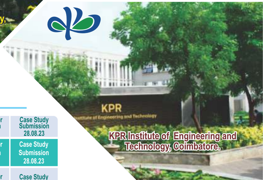
KPR Institute of Engineering and Technology, Coimbatore.

————— Theme ————— “ NURTURE QUALITY CONCEPTS FOR A BETTER FUTURE ”