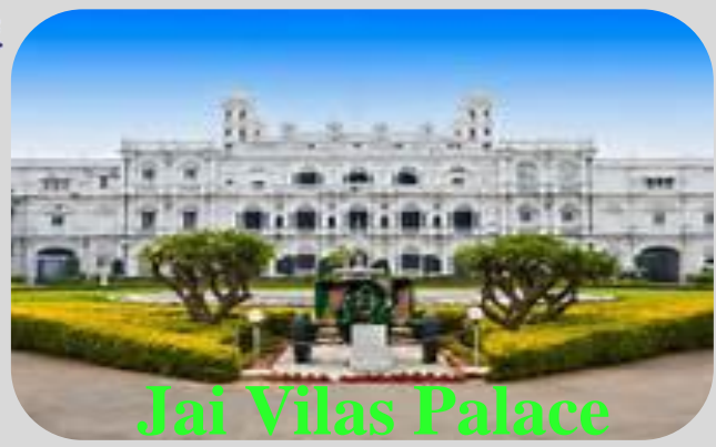
Jai Vilas Palace