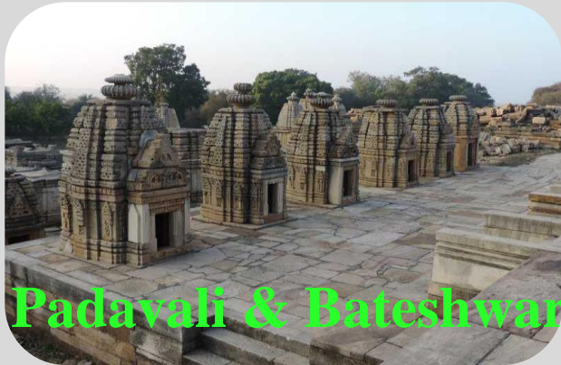
Padavali & Bateshwar