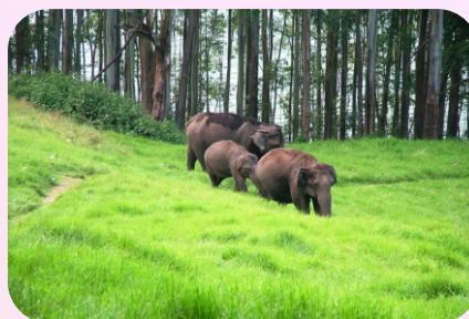
nilgiri biosphere reserve