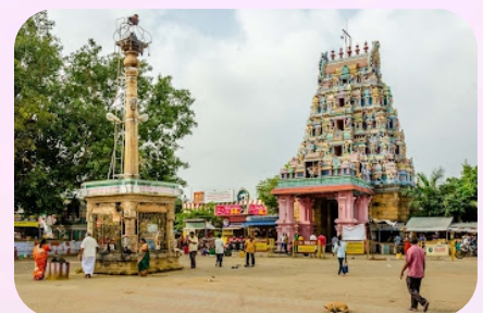
Perur Pateeswarar Temple