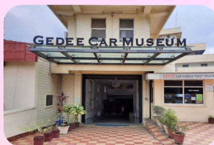
Gedee Car Museum