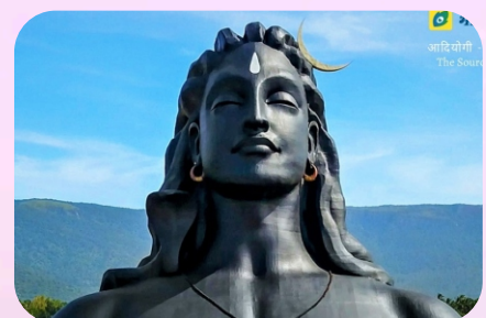
Isha Yoga Center