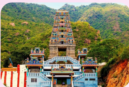
Marudhamalai Hill Temple