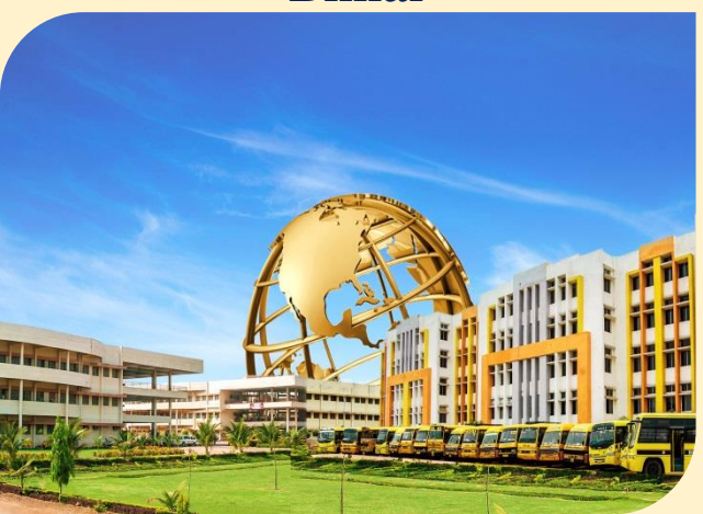
19th & 20th October 2024

Shri Shankaracharya Technical Campus Bhilai