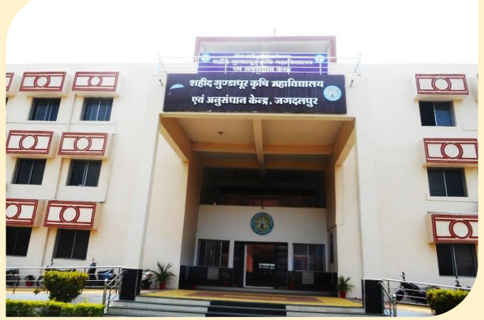
21st & 22nd September 2024

Shaheed Gundadhur College of Agriculture & Research Center, Kumhrawand Jagdalpur