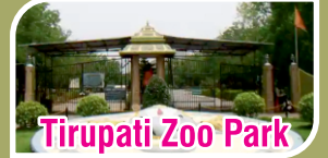
Tirupati Zoo Park