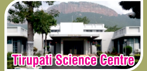
Tirupati Science Centre