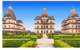
Datia & Sonagir