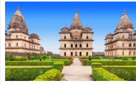
Datia & Sonagir