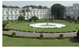
Jai Vilas Palace Museum