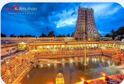
MEENAKSHI TEMPLE (Lotus Tank)