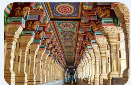
Longest Corridor In India Rameshwaram