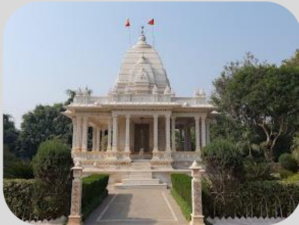
Chhatris of Scindia Dynasty