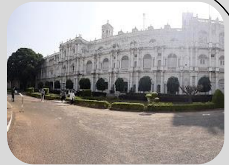
Jai Vilas Palace