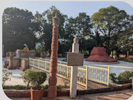
Rani Laxmi Bai Samadhi Sthal