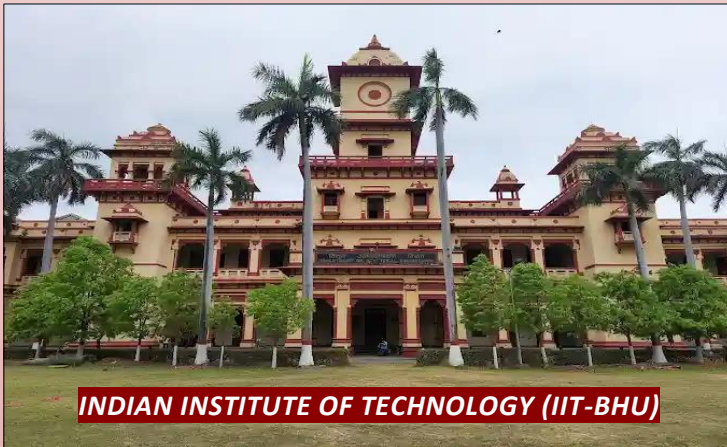
INDIAN INSTITUTE OF TECHNOLOGY (IIT-BHU)