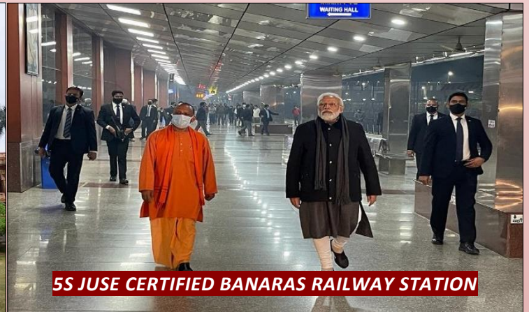
5S JUSE CERTIFIED BANARAS RAILWAY STATION

ORGANISED BY QUALITY CIRCLE FORUM OF INDIA VARANASI CHAPTER