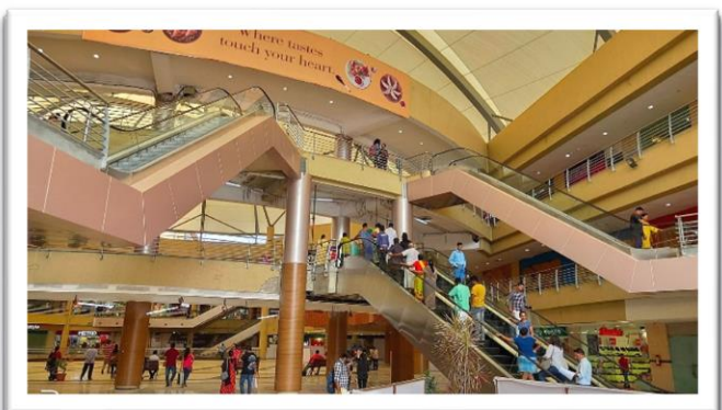
Metro Mall, Kalyan