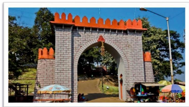
Durgadi Fort, Kalyan - 10 Km