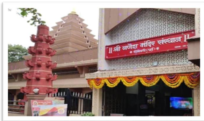
Shri Ganesh Mandir