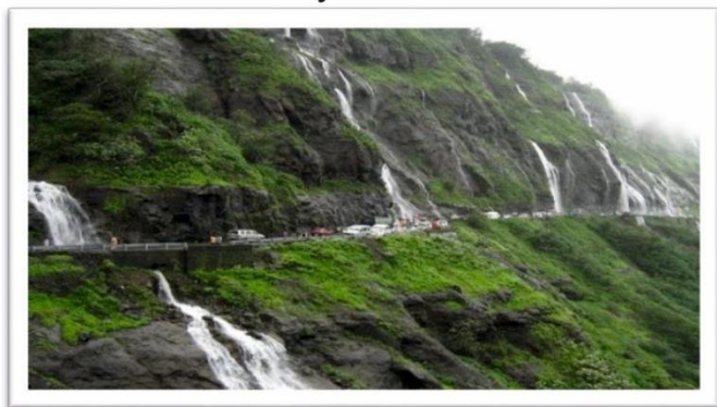
Malshej Ghat - 80 Km