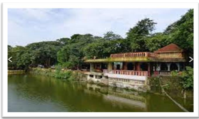
Shri Khidkaleshwar Mahadev Mandir