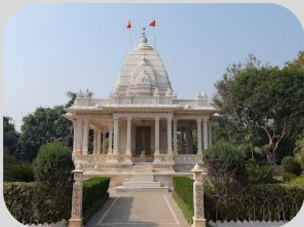
Chhatris of Scindia Dynasty