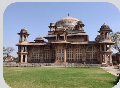
Tomb of Tansen