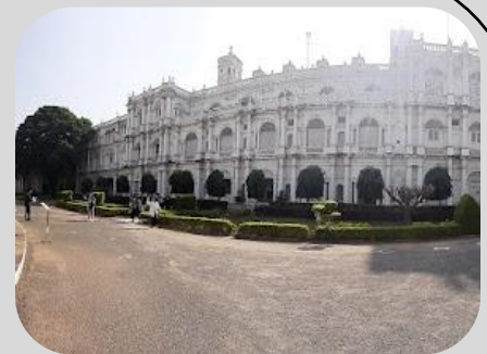
Jai Vilas Palace